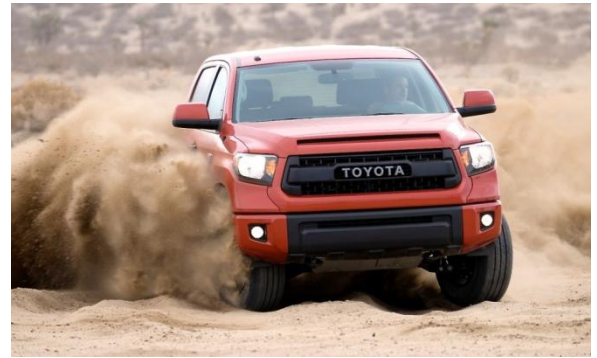
Tundra TRD Pro has several unique exterior and interior TRD Pro-themed elements 1