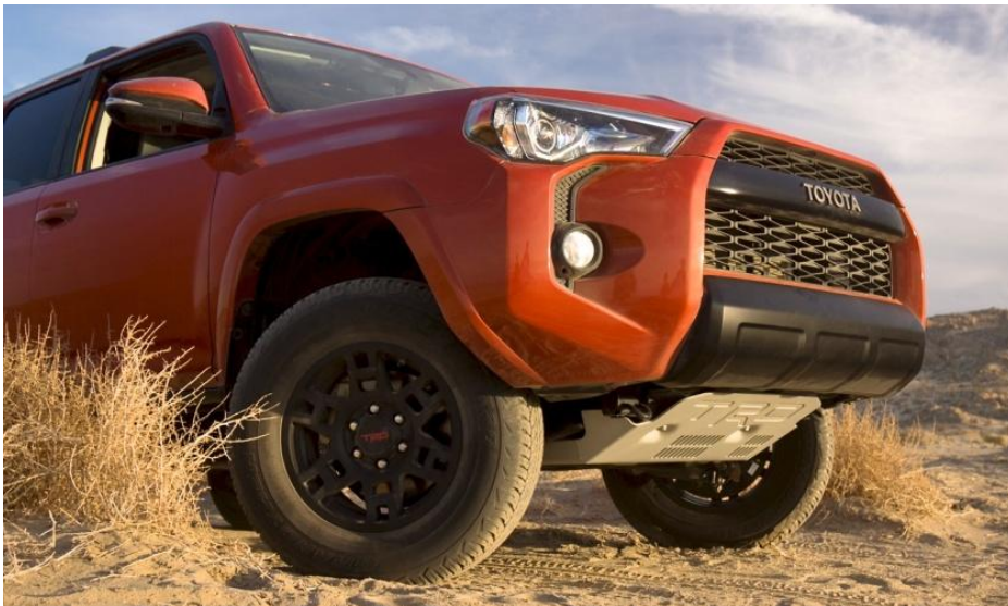
4Runner TRD Pro includes a thick front aluminum skid plate 1

4Runner has many exterior and interior design elements unique to the TRD Pro series; a unique "TOYOTA" front grille that harkens back to the first-generation Toyota 4Runner, an aluminum front skid plate, black "TRD PRO" external hard badges, and new 17" black TRD alloy wheels wrapped with aggressive all-terrain Nitto Terra Grappler tires. Inside, you'll find TRD Floor Mats, black seating with red stitching, and TRD Shift Knob. The 4Runner TRD Pro is available in Black, Super White, and Inferno (all-new exclusive color) paint colors.