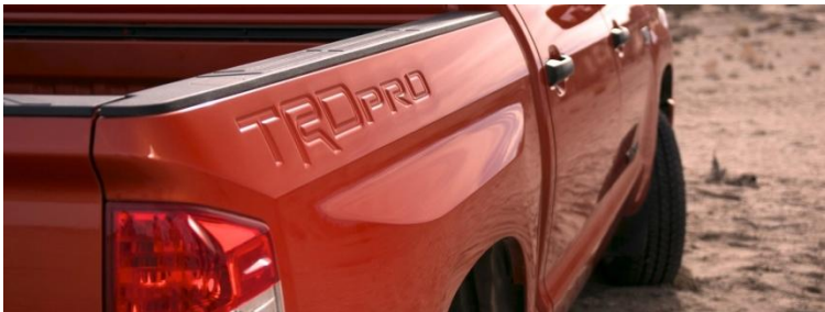
Tundra TRD Pro has a unique TRD Pro bed stamping 1

There are a number of different clues that this isn't your average Tundra; a unique "TOYOTA" front grille that harkens back to Toyota trucks of the past, an aluminum front skid plate, black "TUNDRA"